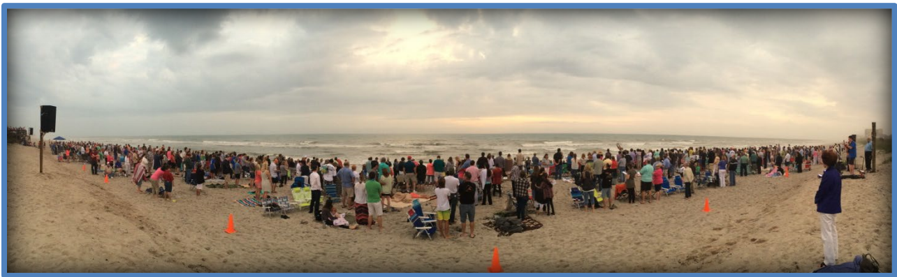
[Easter Sunrise Service 2019: 1,500 people]

On Sunday mornings, our church campus is filled with over 500 people on Sunday mornings. The church’s budget for the fiscal year is approximately $1.5 million.